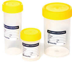
DEF842 SP(Left), DEF758SP (Middle), DEF840SP (Right)