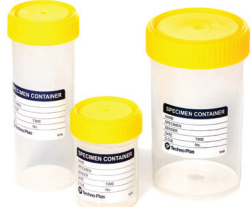
DEF842 SP(Left), DEF758SP (Middle), DEF840SP (Right)