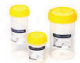
DEF842 (Left), DEF758 (Middle), DEF840 (Right)